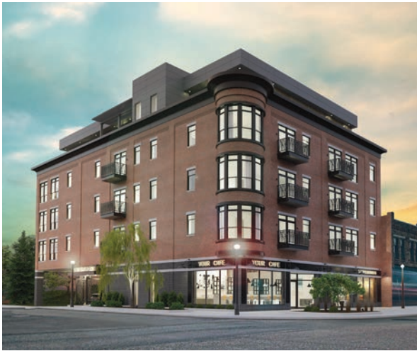
The River Place 212 S River Ave, Holland, MI

Both of these communities are based on a reimagined vision of retirement living—and inspired by the way seniors want to spend their best years. Through these new developments, we're providing innovative solutions for serving our community.