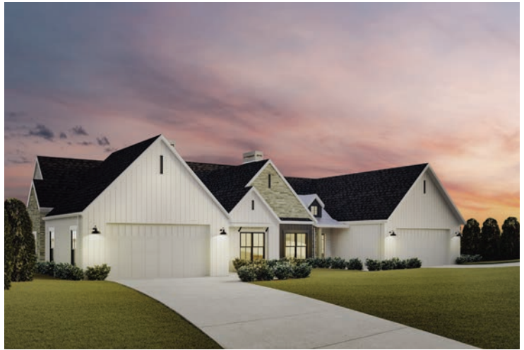
The Farmstead 875 E 24th St, Holland, MI